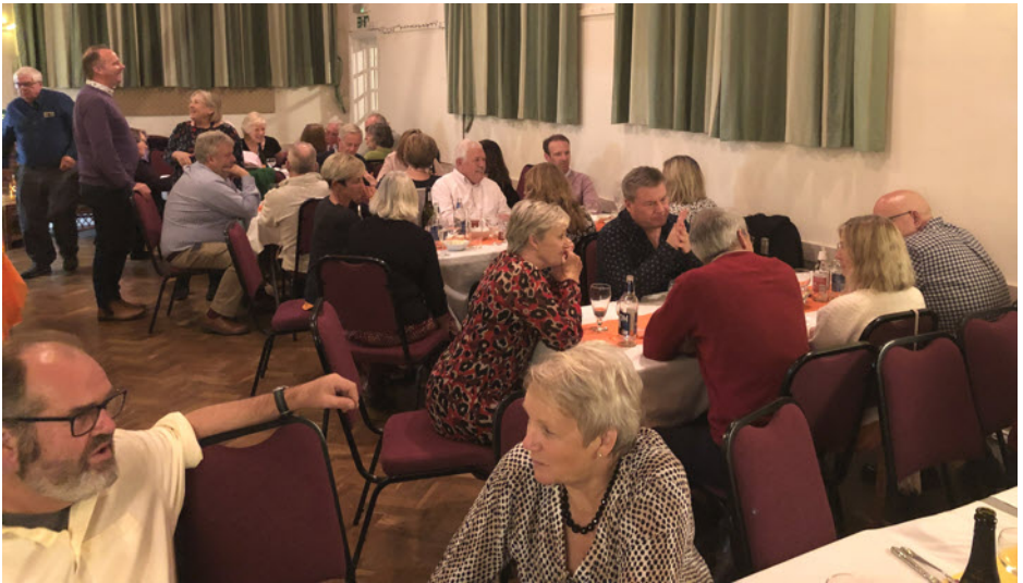
Curry Night