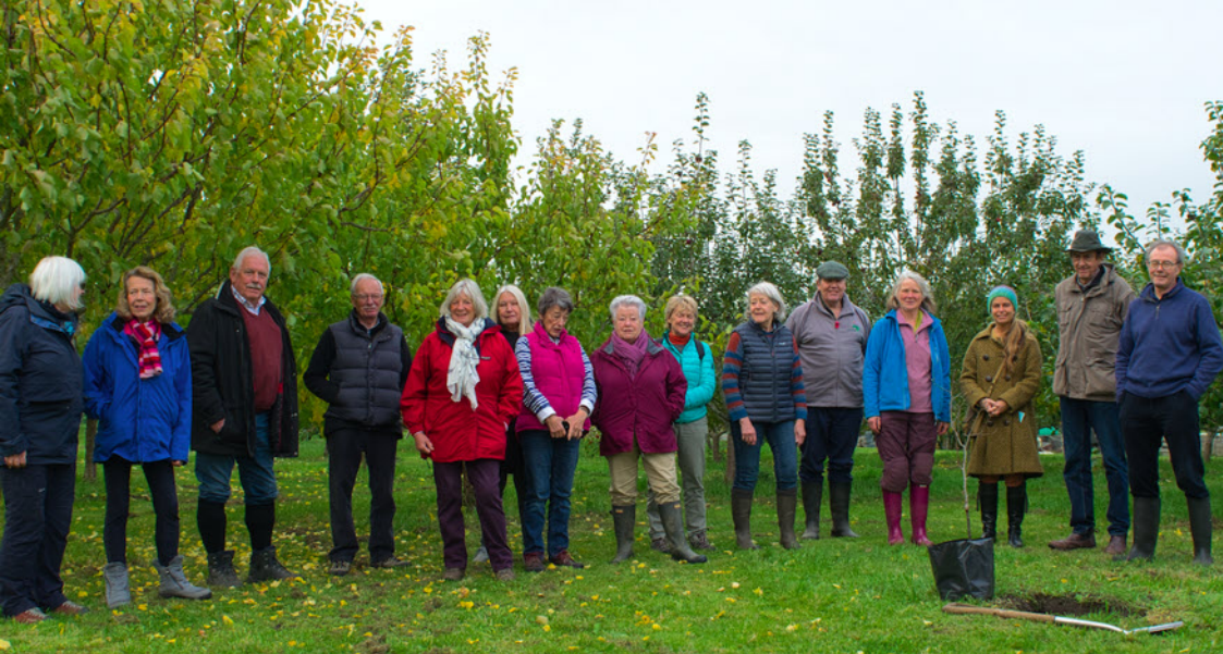
Wot2Grow Community Orchard members with Lord and Lady Northampton