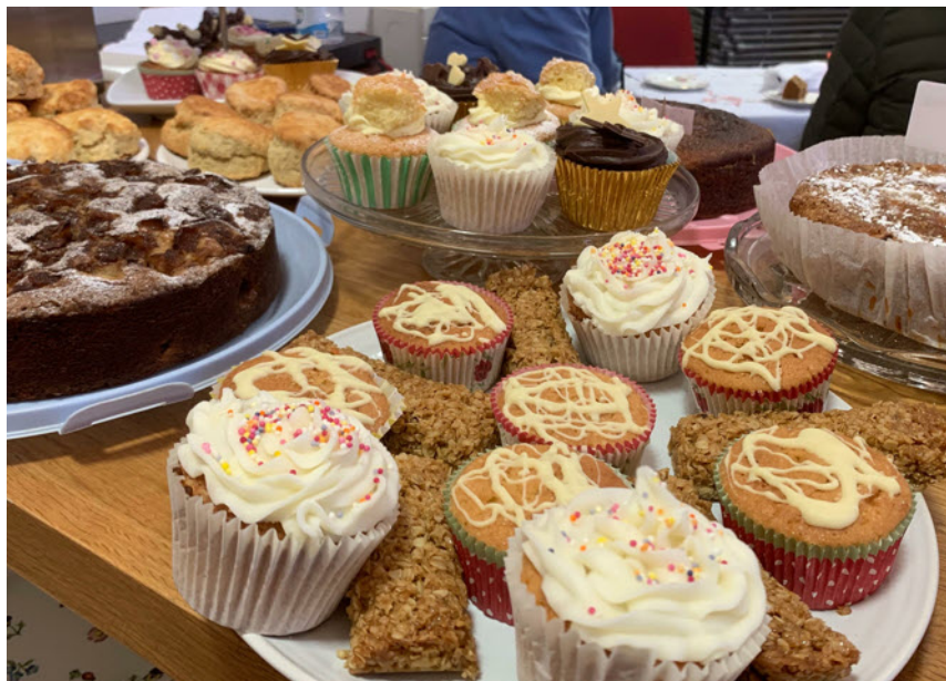
Cakes from the Made in Oxhill Arts & Crafts Pop Up Shop